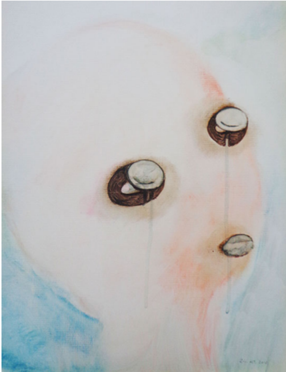
Stone eyes, 2016. Oil on wood 35x26cms