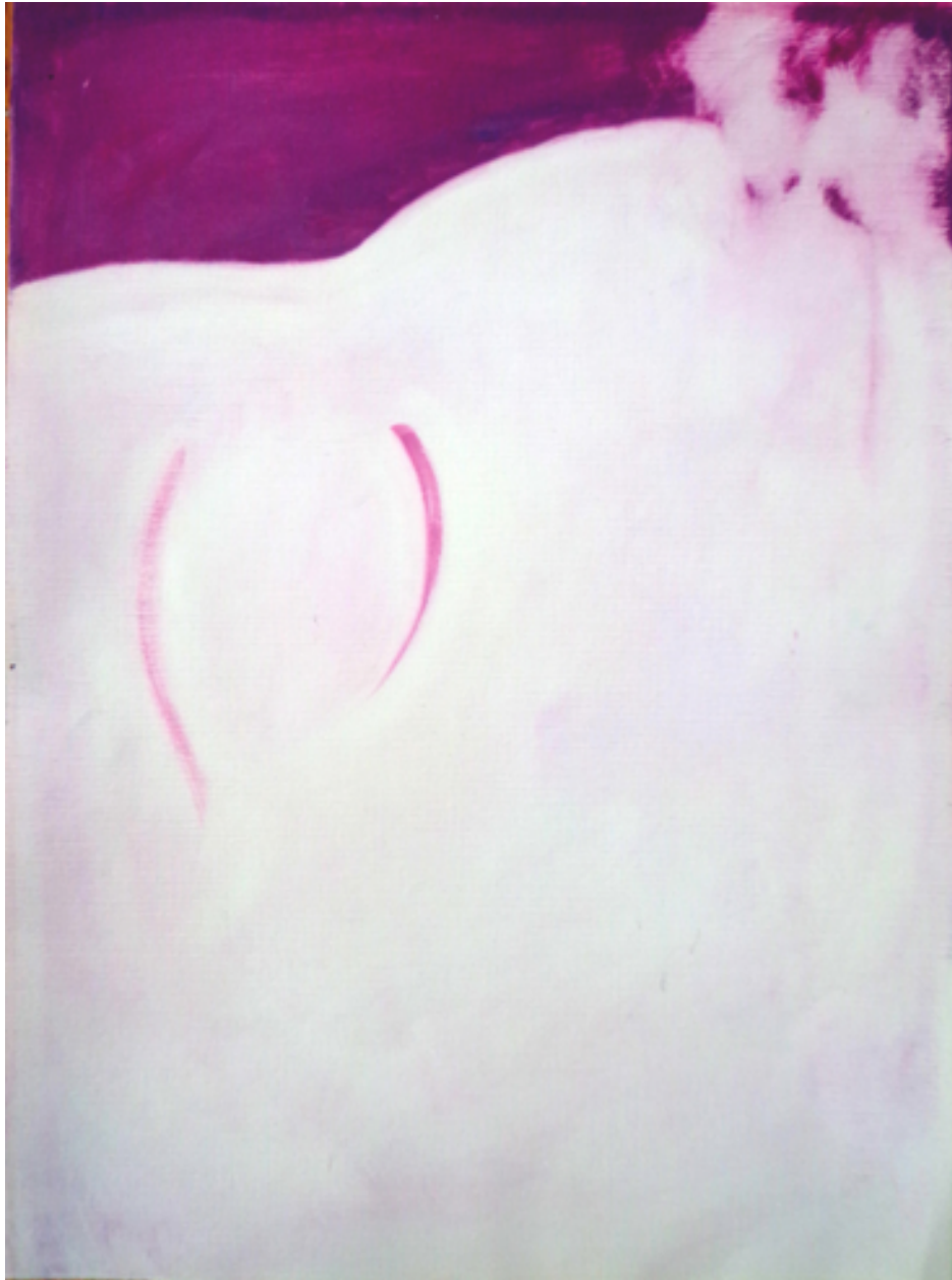
The last breath 2016. Oil on Wood 35 x26cms