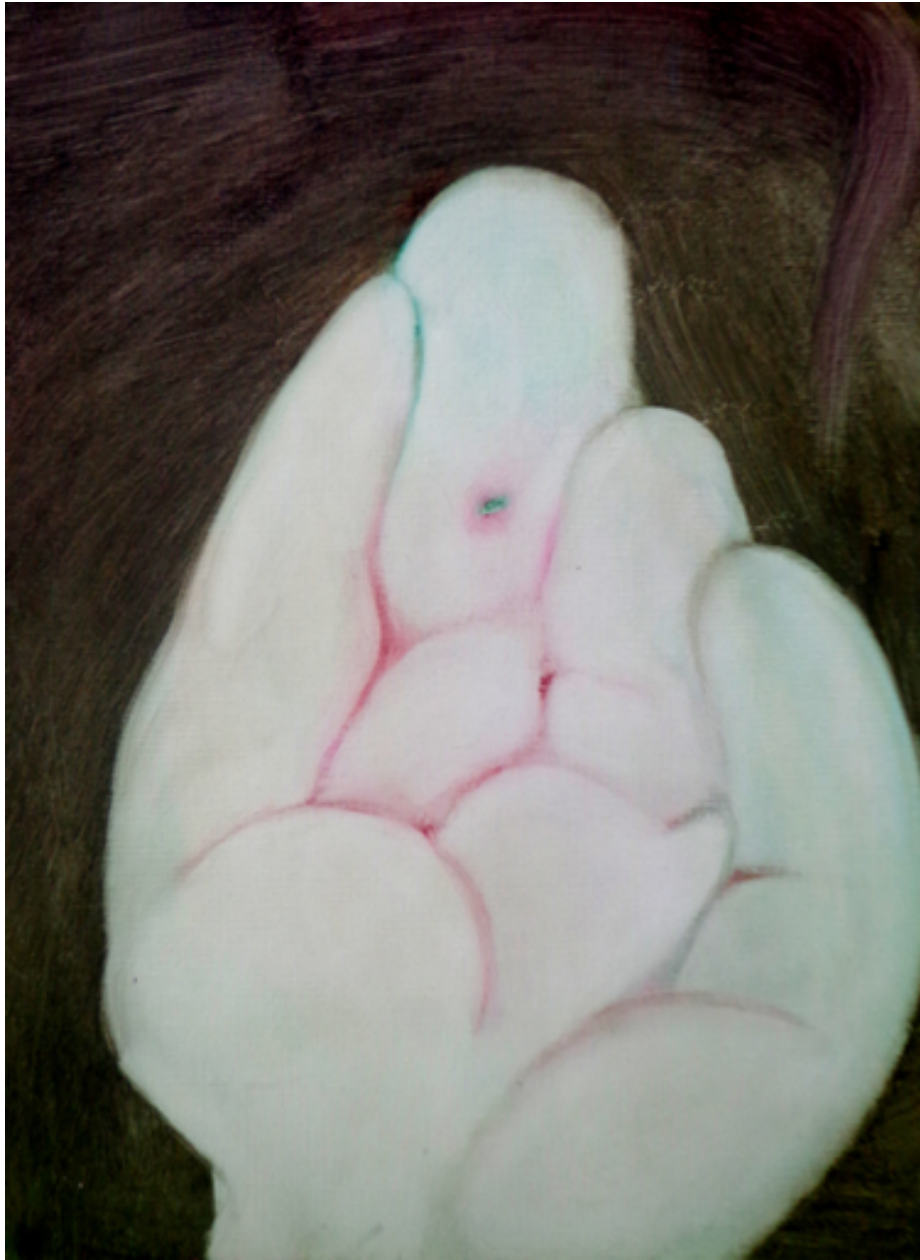
The hand of the monk, 2016. Oil on Wood. 36x25cms