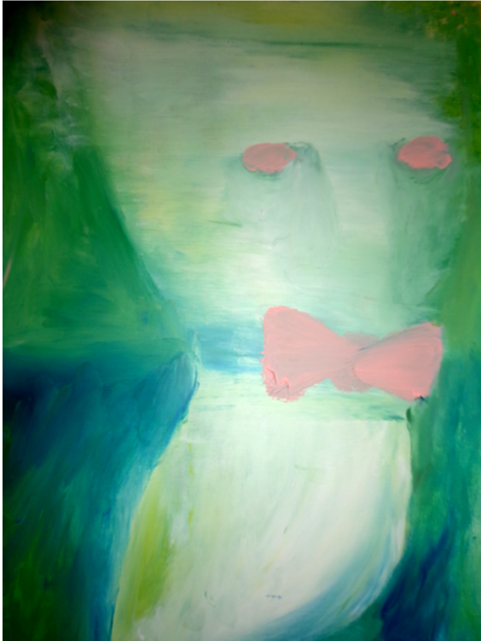
The cat, 2016. Oil on wood 36x25cms