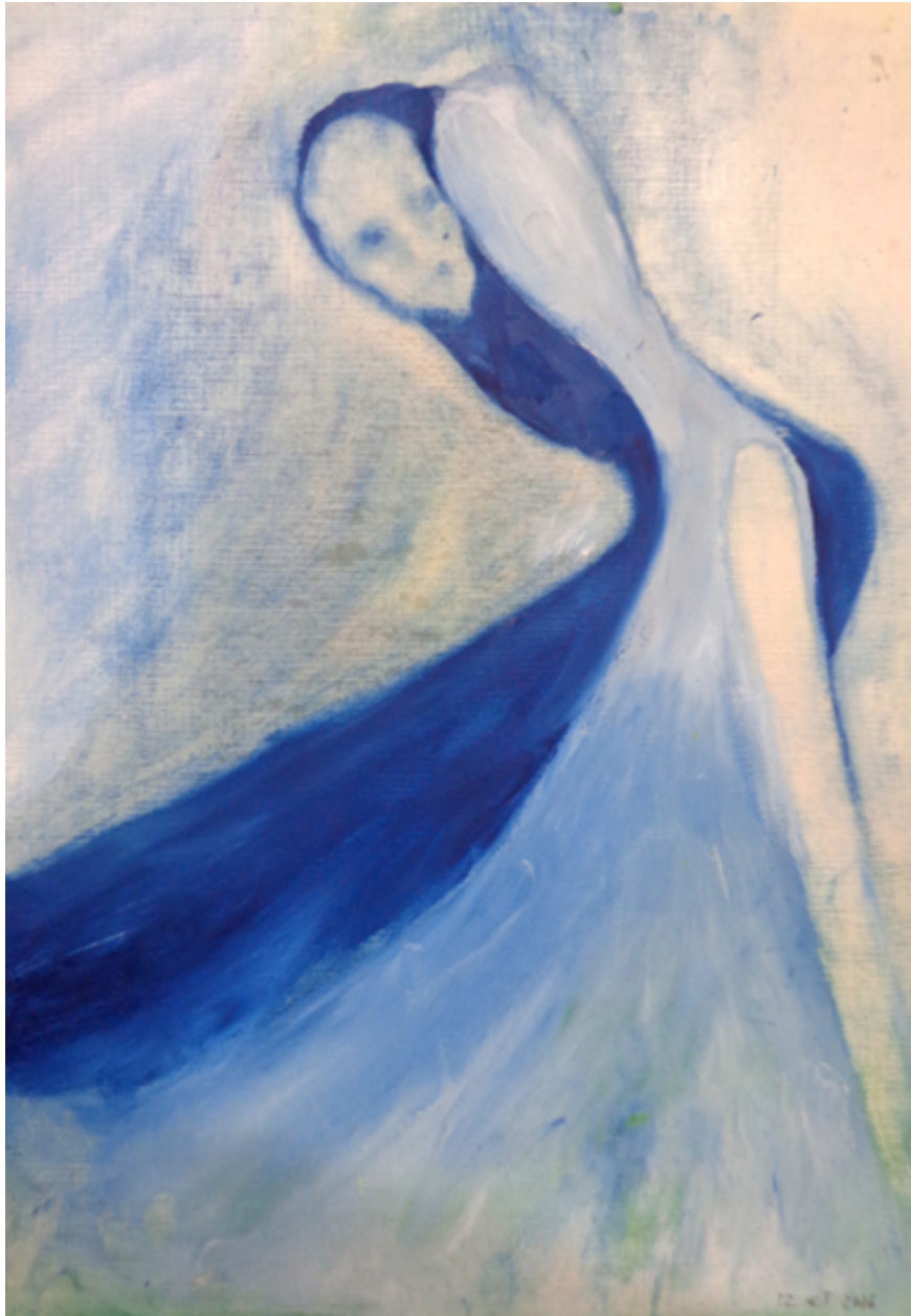
Blue woman and her shadow. Oil on wood 36x25cms